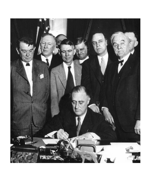
Roosevelt signs the Tennessee Valley Authority Act in 1933.

a position to address and mobilize "minorities" of all