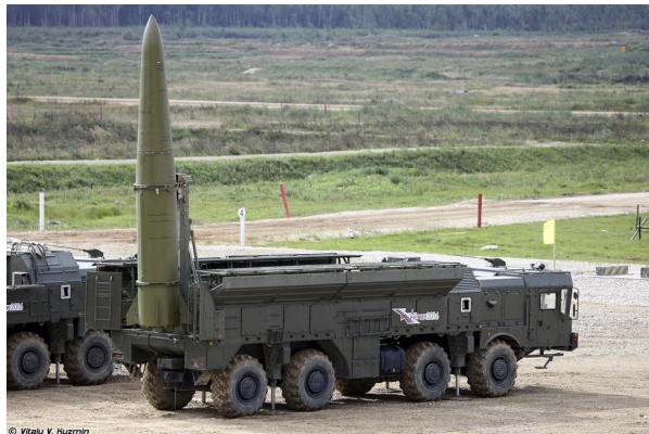
Russian Iskander Mobile Missile Launcher. From Kalinigrad, they can strike Berlin for example.

This is why the current crisis concerning Ukraine and NATO's eastward expansion is so dangerous. It is not so much that this particular crisis is likely to be the immediate catalyst for WWII but that the crisis has the potential to result in a consolidation of mutually antagonistic imperialist blocs. If the US successfully goads Russia into attacking Ukraine, for example to prevent the pro-Russian regions of Donbas being overrun by the Ukrainian armed forces, the US will be in a position to demand the western