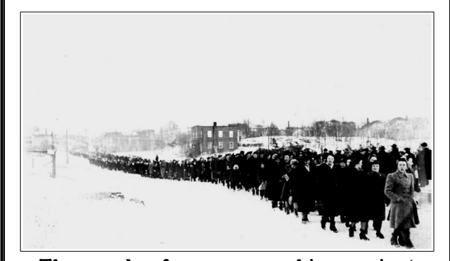
Thousands of women marching against the working conditions of the mines in Kirkland Lake (1941).

Pitched battles in the class war were fought across the country; shipyard workers in Quebec and the Maritimes, workers at the transit system, steel mills, and an aircraft plant in Montreal, steelworkers in Sault-Sainte-Marie, ON, Trenton, ON, and Sydney, Nova Scotia, miners in Kirkland Lake, ON, and Ford auto workers in Windsor all took to illegal strikes in defence of their living conditions.